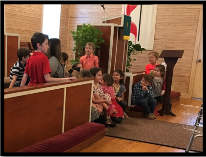
What a joy to have so many sweet young faces during the Children's Message!