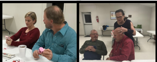
Pictures of some of our great members enjoying Valentine's Dinner together.